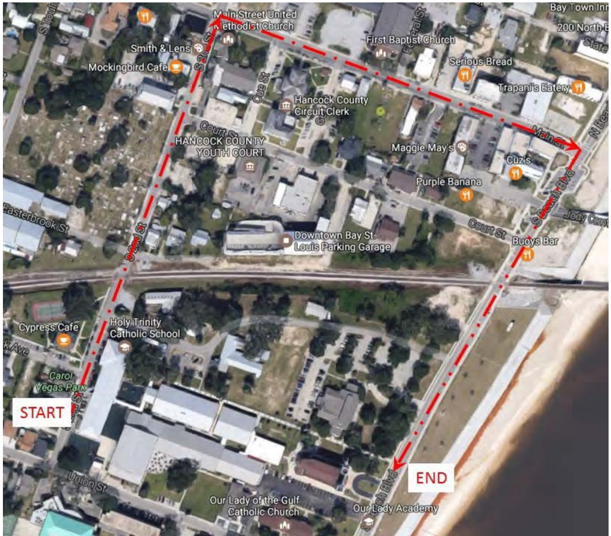
The route taken by the marchers through the downtown region of Bay Saint Louis.