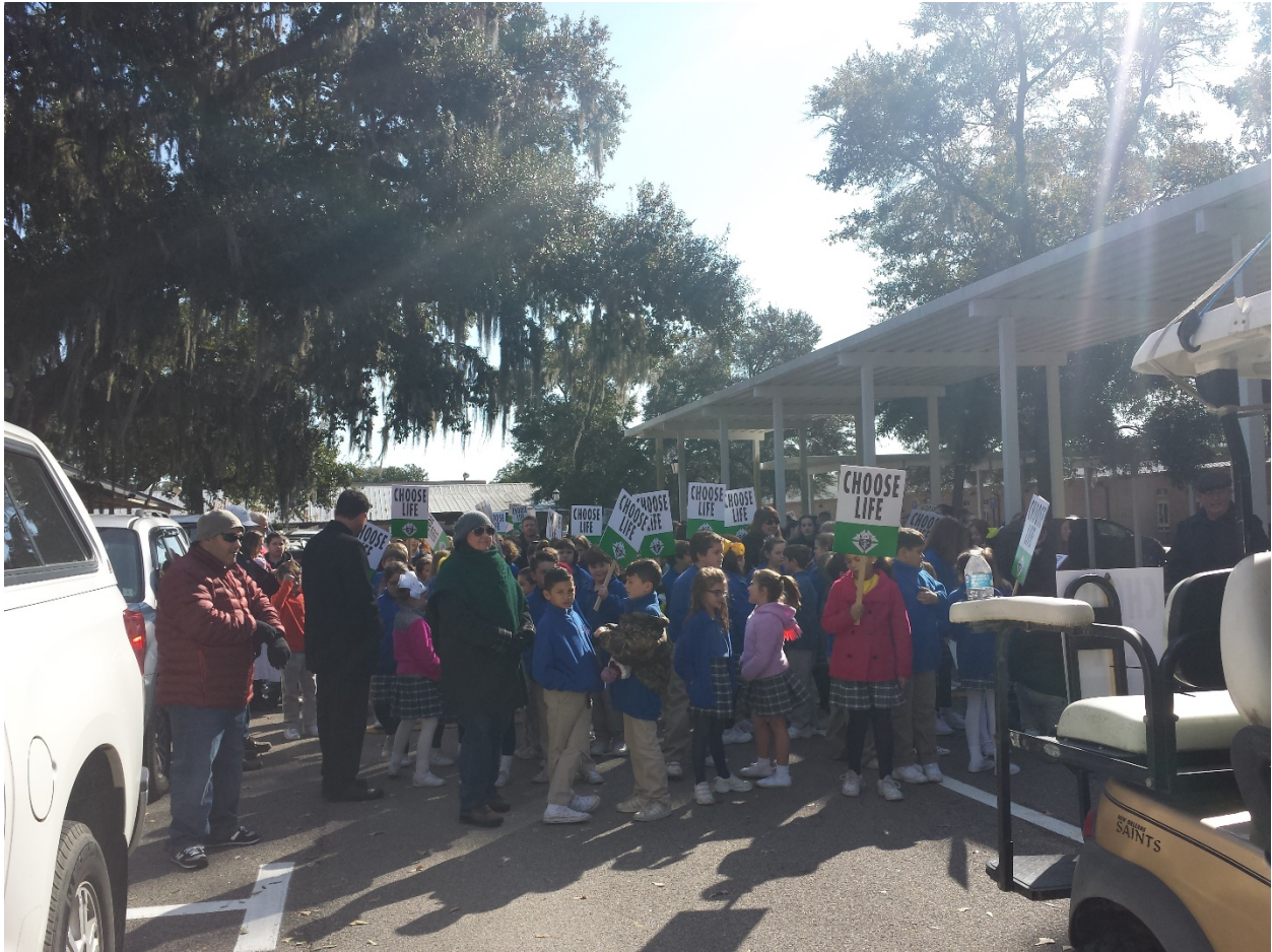
Students waiting for direction to begin their March for Life.