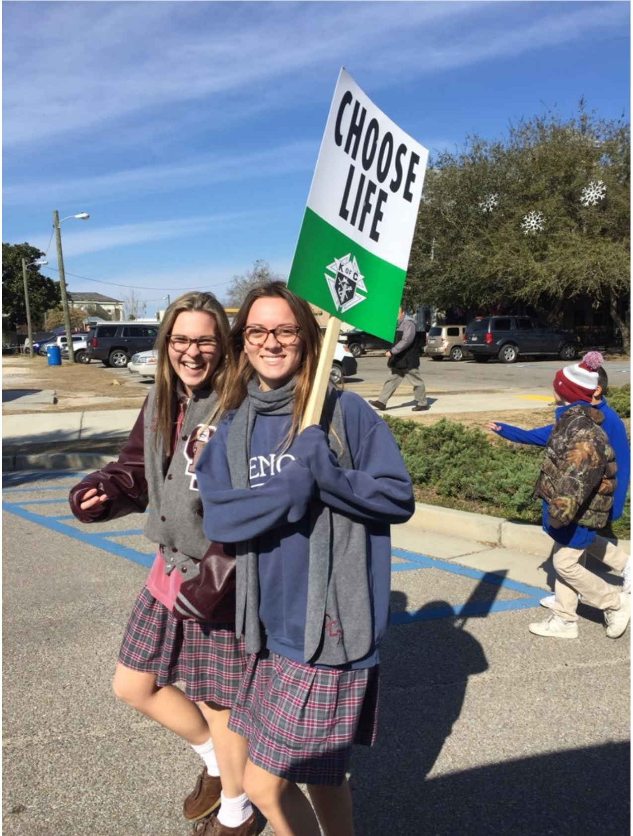
OLA Seniors leading the way for the unborn.